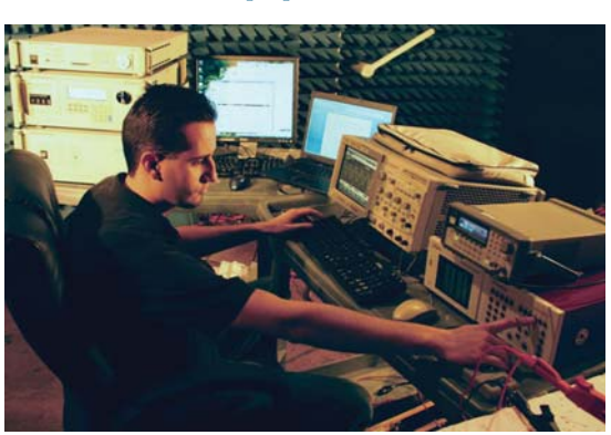
MIL STD 704 testing

of this standard is to ensure the compatibility between the aircraft electrical system, external power, and airborne utilization equipment. D.L.S. tests systems up to 270 VDC. This is similar to the Navy require-