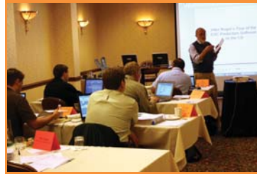
Lecture and Discussion