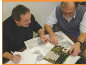
Individual EMC Design Evaluation of Your Product