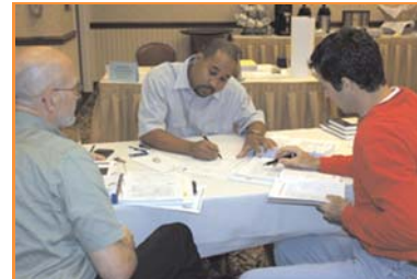
Designing a product to meet EMC compliance, Workshop - Day 3

Students will go through the product's requirements